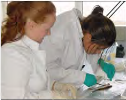
South Island School students gaining work experience