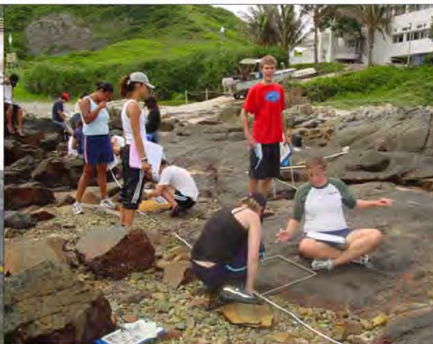
Secondary school students learning field techniques