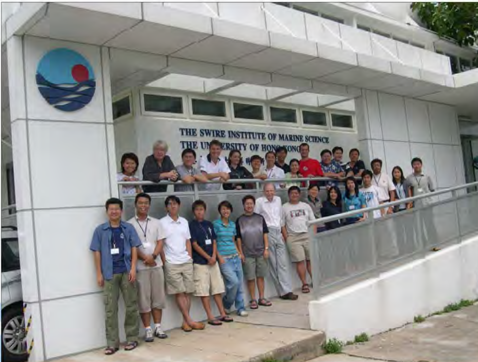
Participants of the PRIMER Workshop held at SWIMS in June 2004

The great success of this workshop will probably be evident in the next year or so when publications from workshop attendees, using these forms of analysis, will start to appear in the literature. Due to the success of the workshop, and further expressions of interest to attend, we plan to run another workshop in 2-3 years' time.