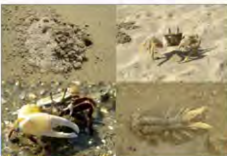
Burrowing crabs and shrimps on sandy shores

My research interests lie in supply-side ecology, population ecology and the biology of crustaceans, particularly barnacles. My early research on the intertidal environment focused on the basic ecology of the acorn barnacles, Tetraclita squamosa and T. japonica , which are the major space occupiers on rocky shores. This included adult and larval morphologies, population dynamics and the factors affecting their post-settlement mortality. This research has subsequently expanded within the Asian region through studies into the effect of latitudinal gradients on the vertical and horizontal distribution patterns and larval supply of Tetraclita spp. from Japan and Taiwan to Hong Kong. Besides research on rocky shores, I also work on the population ecology and burrow morphology (using resin casting techniques) of sandy shore crustaceans including the mud shrimps Austinopecten edulis , ghost crabs Ocypode spp. and fiddler crabs, Uca spp.