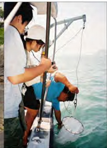
Environmental Life Science students sampling plankton