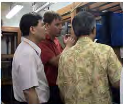
Visitors from Japan and Chinese University, HK admire the new aquarium facilities