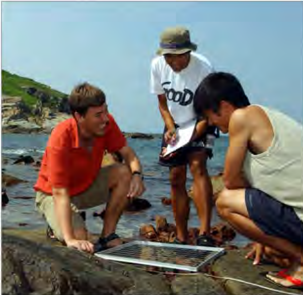
Field work at Cape d'Aguilar

One of the main foci of my research is how animal behaviour impacts on community structure. By understanding the factors that determine when animals move and where they go it may be possible to predict their predation/grazer impact and, therefore, how this ultimately controls rocky shore community structure. Many factors affect these two simple measurements, including endogenous (internal) and exogenous (external) factors.