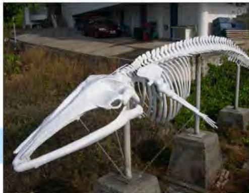
Winsome Paints sponsored the repainting of the whale in 2004