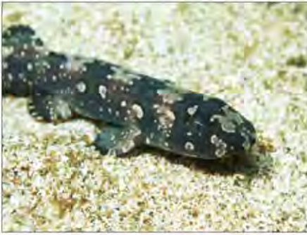
Newly hatched bamboo shark

Although sharks are feared in Hong Kong following a series of attacks on humans in the mid 1990's, only one species is resident here, the harmless white-spotted bamboo shark ( Chiloscyllium plagiosum ), a small, bottom-dwelling species. Little is known about this shark, and I have been studying its diet and reproductive biology in order to better understand how it is able to survive the intense fishing pressure in local waters.