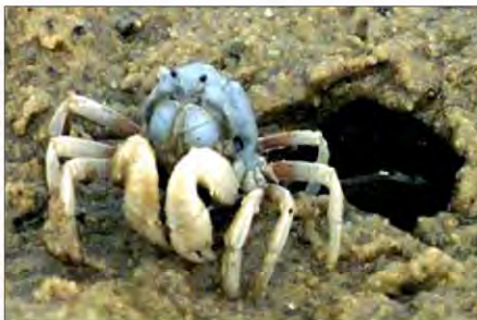
The soldier crab, Mictyris longicarpus