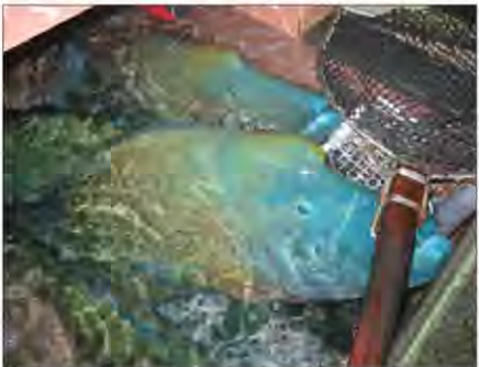
Humphead wrasse in a local restaurant tank

Fisheries are globally important, not only for food but also for livelihoods. Yet, in the last decade, more and more have shown clear evidence of declines, marine ecosystems have changed, diversity has decreased and fisheries are collapsing. Hong Kong's fishery and marine ecosystem are no exception, with serious catch declines and threats to biodiversity.