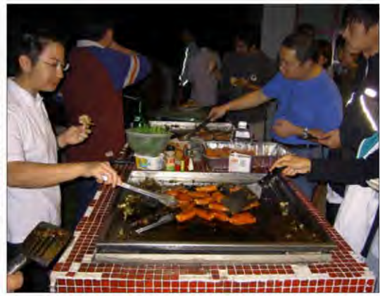
SWIMS past and present students and staff enjoy a BBQ with MBAHK members