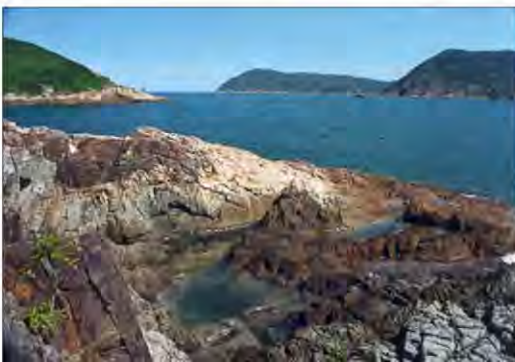
Low-shore rock pools at Cape d'Aguilar

Wai Tak-Cheung has recently completed his postgraduate research into herbivore-induced effects and persistence of non-geniculate coralline algae in low-shore rock pools. Crustose coralline algae (CCA) are the dominant algal group all year round in low-shore rock pools within the Cape d'Aguilar Marine Reserve. Although their distribution is seasonally stable, their relative abundance varies seasonally among, and within, pools. Wai investigated the effects of grazers, individual pool and seasonal availability of bare surfaces on the algal colonization of artificial plates in the rock pools. Similar to other coralline dominated habitats, the establishment and persistence of CCA in the pools was maintained by frequent disturbance. Disturbance in the form of herbivore