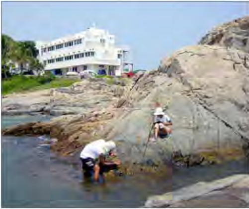
Avis monitoring limpet movement on the shores at Cape d'Aguilar

In an attempt to predict the distribution of grazing pressure exerted by the rocky shore limpet, Cellana grata , Avis Ngan is using data collected from the field and laboratory in conjunction with computer modelling. C. grata is the dominant grazer in the mid to high intertidal in Hong Kong and has been shown to limit the growth of biofilm where it feeds. The life-history of this species is functionally linked to the availability of food, showing a bottom-up effect, where the resource impacts consumer populations. Avis's project builds on previous studies by investigating the top-down effects that the consumers have on their resource. This involves studying the rules governing the organisation of limpet foraging in time and space. Computer simulation can then be applied to these rules to predict limpet foraging given different environmental parameters. Avis's ultimate aim is to develop a predictive tool and a mechanistic understanding of the relationship between C. grata and the biofilm on which it feeds, and he is currently collaborating with colleagues in Firenze University, Italy to achieve this goal.