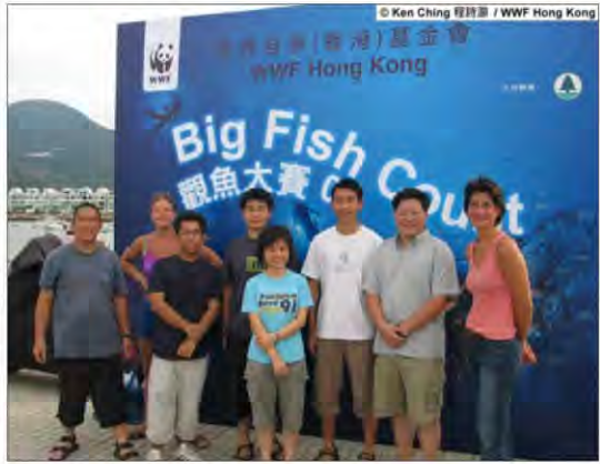
The winning Big Fish Count Team