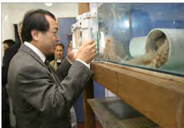
Prof. Tsui Lap-Chee studying an octopus