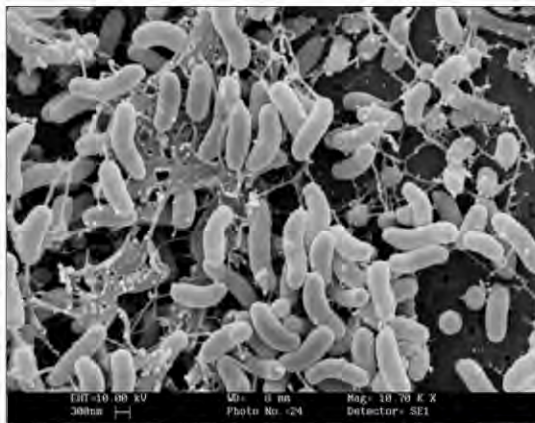
Scanning Electron Micrograph of Vibrio species

One of the research projects in my laboratory has been to gain an understanding of the new emerging, potentially pathogenic, bacteria found in our environment. Our major effort has centered on pollution issues at Mai Po Nature Reserve. Vibrio species were chosen for study as they are important disease-causing agents in aquatic environments and also infect humans in tropical and subtropical regions. Environmental strains of Vibrio species have been isolated for investigation from both Mai Po Nature Reserve and Cape d'Aguiar.