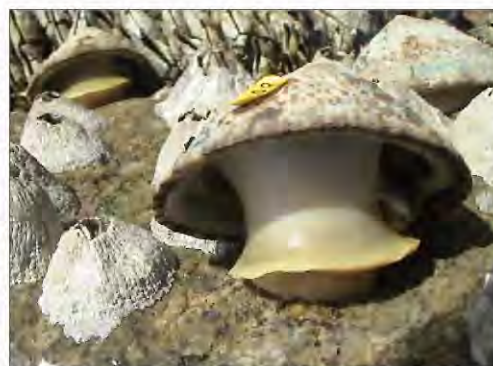
Limpet "mushrooming" in response to heat stress

It has been suggested that induction of heat shock proteins (Hsps) can enhance thermal tolerance and reduce damage from heat stress in animals at both cellular and organismal levels. Intertidal organisms face an extremely dynamic environmental regime, where physical factors like temperature and desiccation extremes have long been established as factors limiting their distribution. However, relatively few studies have investigated the importance of physiological/molecular factors. Lai Chien-Houng is researching the kinetics of Hsp synthesis in two common intertidal limpets: Cellana grata and C. toreuma to evaluate the temporal profile of this molecular response to heat stress. Currently he is establishing the responsiveness and magnitude of Hsp synthesis for the two limpet species after a heat shock event, but ultimately Chien-Houng hopes to be able to infer the importance of Hsp synthesis in establishing habitat partitioning between different species in the intertidal zone.