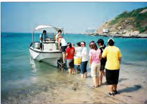
B.Sc students boarding the Boston Whaler for field work