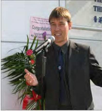
Welcoming guests to the reopening ceremony

This is the first annual report from the Swire Institute of Marine Science (SWIMS) since its reopening on 3 rd December 2003. The present report encompasses not just the last year since the reopening, but also the period from July 2003 when we actually moved back into SWIMS. The renovation and reopening of SWIMS heralded a new era, and SWIMS now boasts the most modern and up-to-date aquarium and laboratory facilities, as well as improved accommodation and seminar facilities.