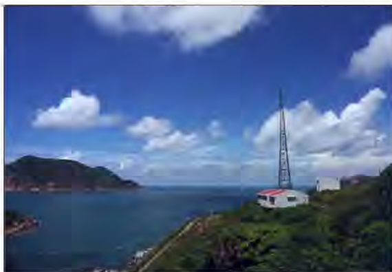
Residential block overlooking the Marine Reserve