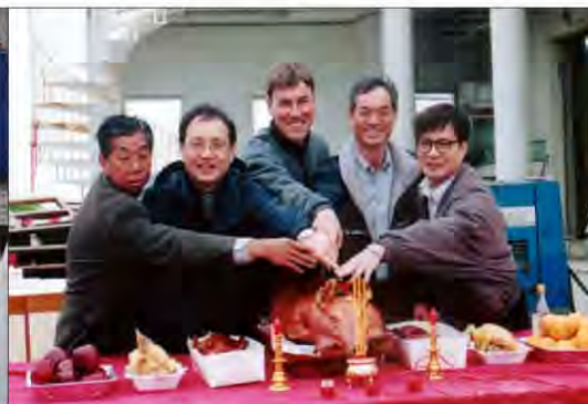
Pig cutting ceremony to celebrate the start of the renovation