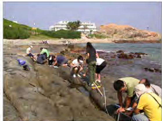
M.Sc. students conducting transect work as part of their Environmental Management course

We have hosted a number of different secondary school groups at SWIMS, where they attend seminars and also conduct fieldwork based on their curricula. These students are always excited to visit SWIMS, and see the research that is going on at the Institute. They are particularly thrilled to see marine organisms in their natural habitats and also to be able to pick them up and examine them close-up in our aquarium. A visit to SWIMS therefore combines the serious study of aspects of the students' curricula but also the fun of discovery! Many of the students are also unaware of the Marine Reserve and so these trips highlight the importance of marine conservation. We hope that such visits will encourage young people to respect the marine environment and may inspire some of these students to study environmental science at The University of Hong Kong.