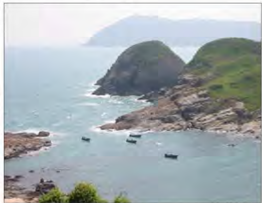
Fishing boats illegally enter the Reserve to collect sea urchins