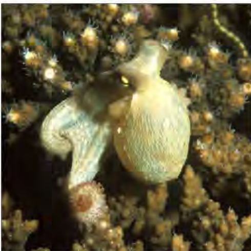
Octopus hunting at night

My principal research interests concern the biology of fisheries resources, in particular, the cephalopods (i.e. octopus, cuttlefish and squid). The cephalopods are the most highly developed of the invertebrates, exhibiting complex behaviours and learning capabilities, and they are voracious predators that play a key role in marine ecosystems. Moreover, cephalopods constitute a high-value component of the commercial catch from the South China Sea. Despite this, there is a paucity of information on the biology and ecology of local species.