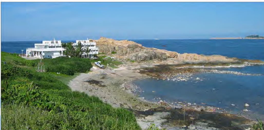
The newly renovated Swire Institute of Marine Science