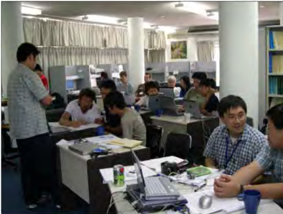
Participants working in the seminar room