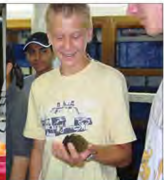
A sixth form school visitor gets to grips with a sea urchin in the SWIMS aquarium